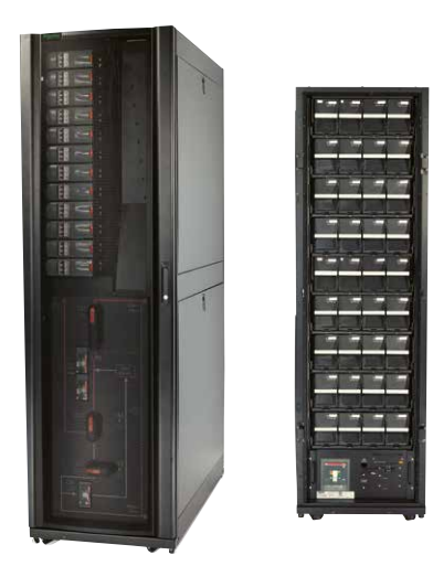
3-in-1 modular power distribution, maintenance bypass, and battery cabinet