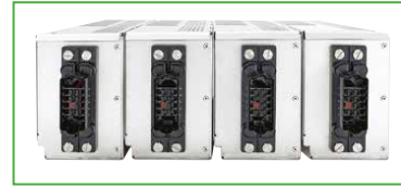
Patented battery module connectors