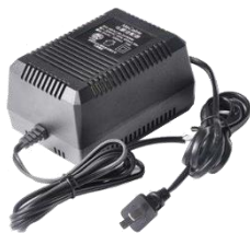
TEAC-66-243000V (EU) MKAC-66-243000U (USA) TEAC-66-243000VB (UK) Power adapter (for outdoor model)