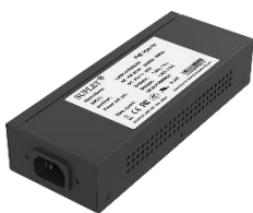
LAS60-57CN-RJ45 Hi-PoE Midspan