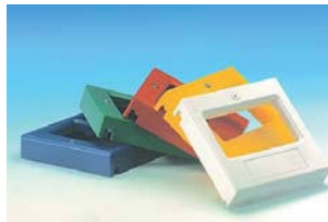
RANGE OF CASING COLOURS White, Yellow, Green, Red, Blue